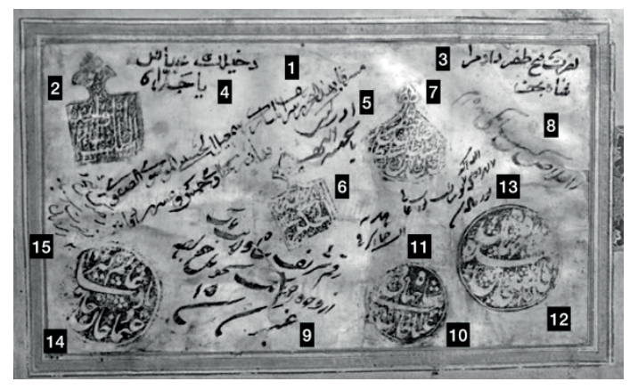
Figure 2. Qur'ān, folio 20v, numbered key to the seals and notations. India Office Collections, British Library, IO Loth 4. https://doi.org/10.5281/zenodo.6810826