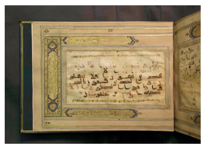
Figure 1. Qur'ān, folio 20r, showing colophon with the name of Imām 'Alī in the last line. India Office Collections, British Library, IO Loth 4. https://doi.org/10.5281/zenodo.6186965